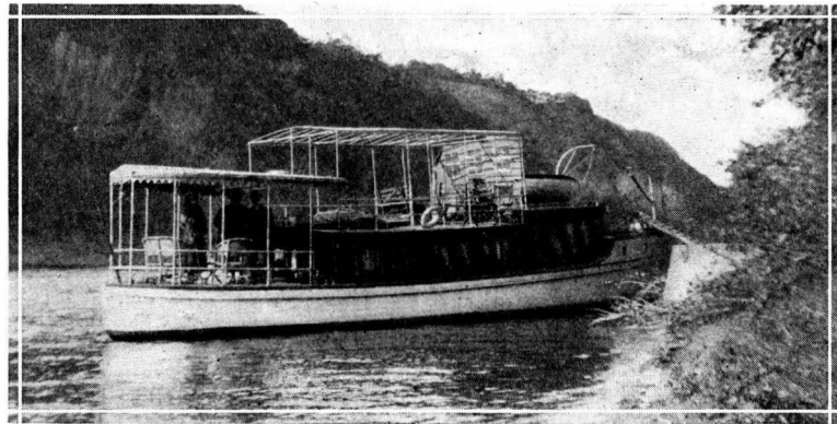
The Arbutus, owned by F. G. Bell, in which we made tour of investigation.

those ponds and lakes and all those scores of little rivers. Think of the most beautiful lowlands your mind can picture. Dream of every kind of wild swamp flower, including the lotus beds, and don't forget the wild rice fields and the waving swamp grasses billowing in the breezes. Think of the rushes and the willows and the water trees and the wild grape vines, and above all the birds—not forgetting the black birds with their soft flute-like wake up notes as morning breaks. But what's the use, if you love a swamp just as does every hunter and fisherman ever born, then you know just what I mean—one can feel such places as is the Winneshiek but one can't describe them. Even as no man has ever been able to adequately picture the Grand Canyon in words so no man can describe the Winneshiek.