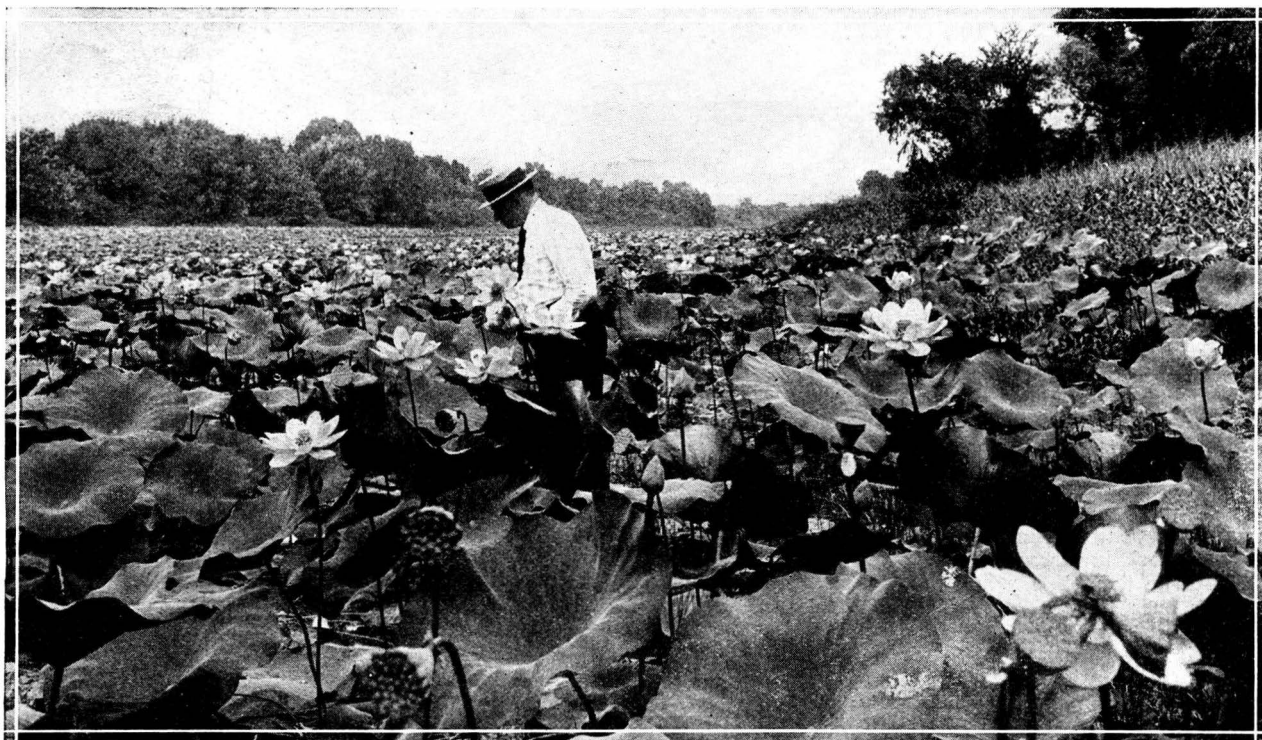
A Lotus bed in the Winneshiek

let's not waste time on the suckers. It's far saner to think of your boy and the coming generations of boys who are being SOLD OUT .