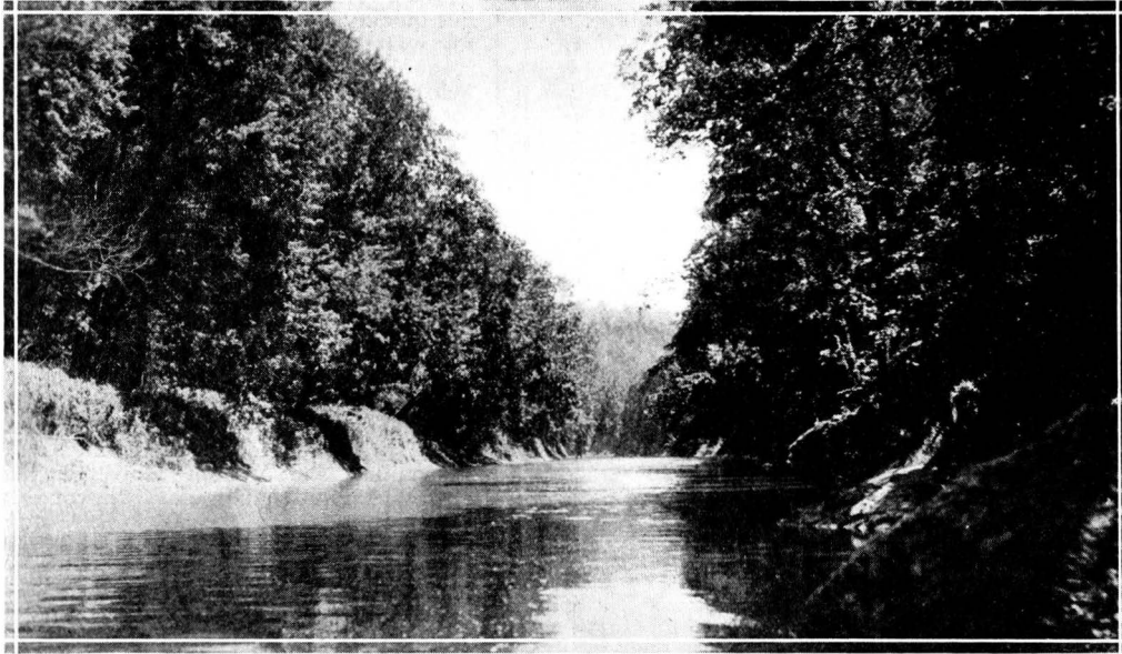
Lost Man's Slough in the Winneshiek.

It will cost you a two cent postage stamp—a